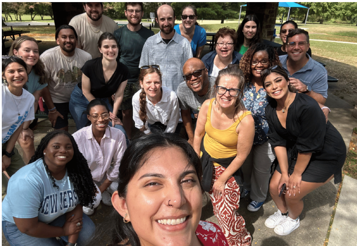
New Jersey LCV staff park day